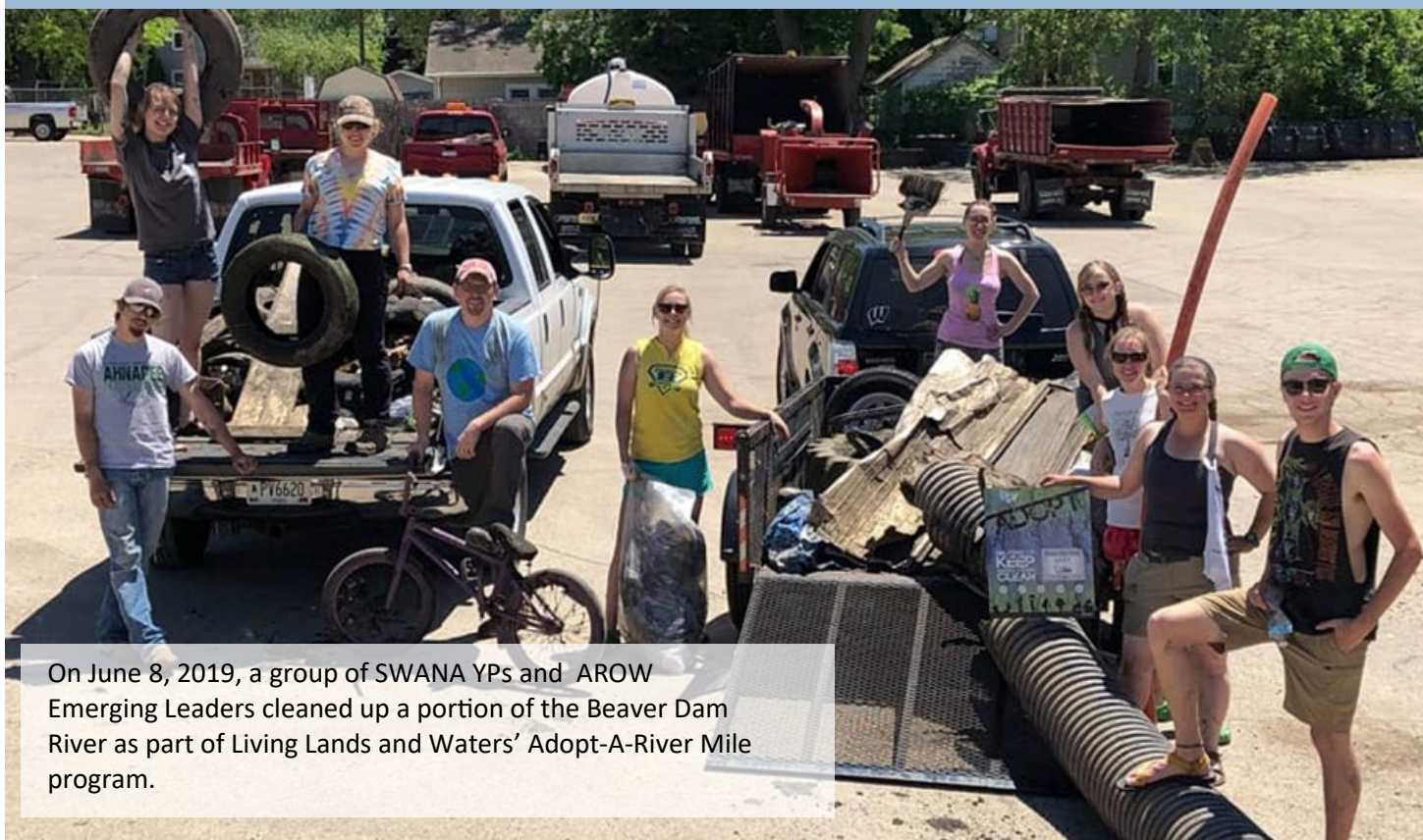
On June 8, 2019, a group of SWANA YPs and AROW Emerging Leaders cleaned up a portion of the Beaver Dam River as part of Living Lands and Waters' Adopt-A-River Mile program.

This newsletter is intended to highlight the hard work and dedication of the Badger Chapter Young Professionals (YPs).